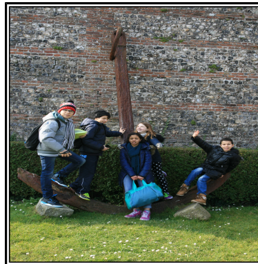
The anchor in the castle

Next to the museum, there was a painting of the Dieppe's beach called « La plage de Dieppe vue de la falaise ouest», by Eva Gonzales. She painted it in 1870.